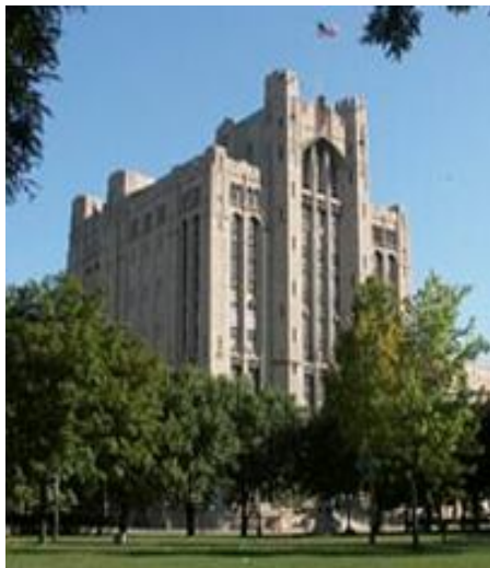
The Detroit Masonic Temple Home of Union Lodge since 1926